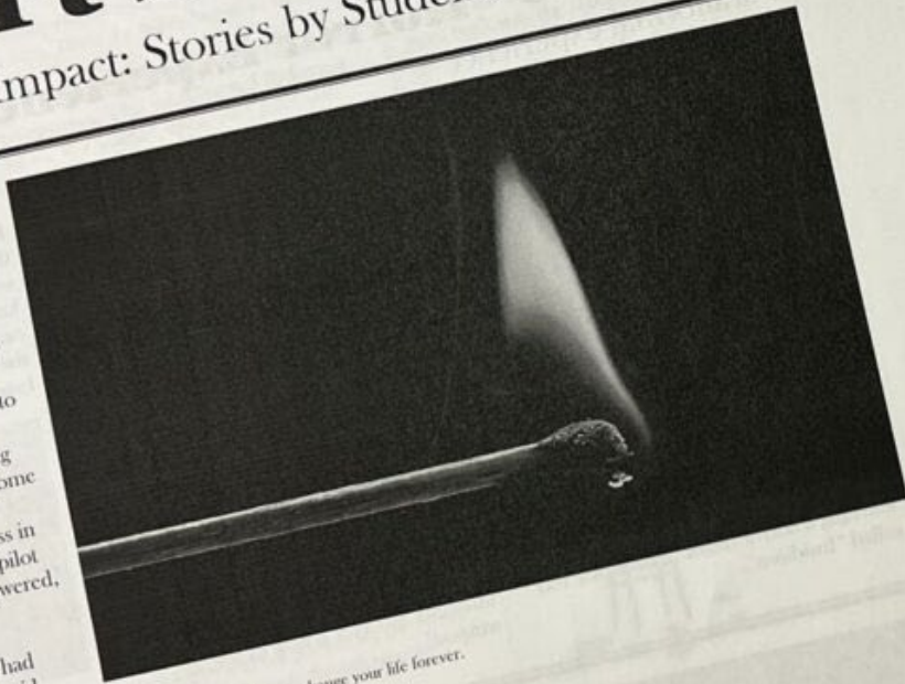
One strike of the match may change your life forever.